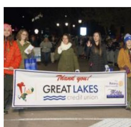
Naperville Rotary Club's Holiday Parade of Lights

WHEN: November 24 at 7 pm WHERE: Jackson and Webster Streets, Downtown Naperville