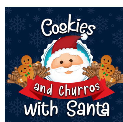
Cookies and Churros with Santa

WHEN: November 24 at 7 pm WHERE: Jackson and Webster Streets, Downtown Naperville